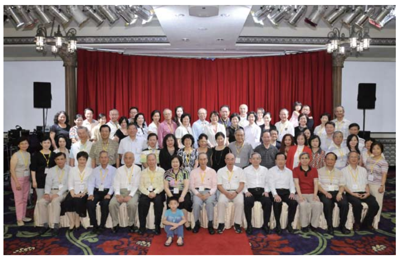
The 19th joint meeting of the 10th Directors and Supervisors on July 27-28, 2012