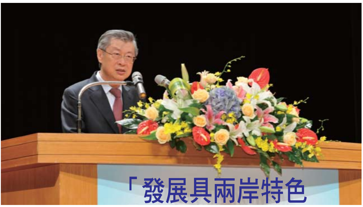
" Program for Development of Financial Services with Cross-strait Characteristics" seminar on September 19, 2012