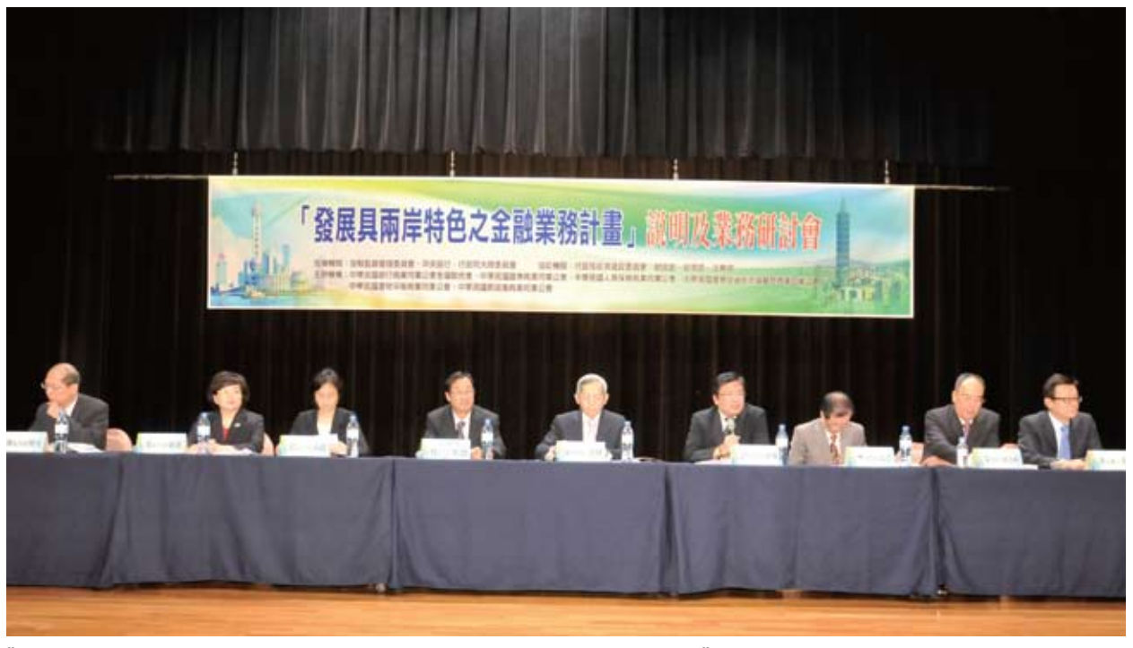
" Program for Development of Financial Services with Cross-strait Characteristics" seminar on 19 September 2012