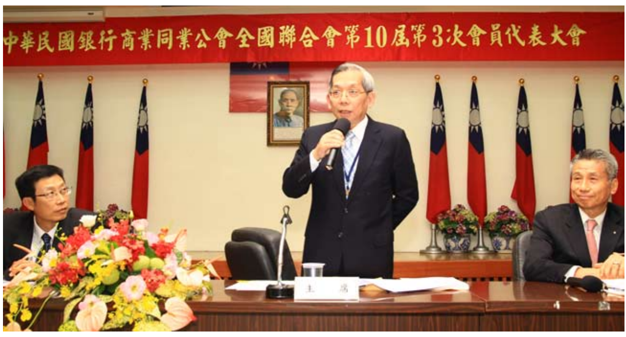
The 3rd Session of the 10th General Assembly on November 20, 2012